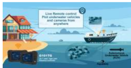
Application Diagram: Enhancing Underwater Drone Control

“ SEAMLESS PERFORMANCE BENEATH THE SURFACE. ”