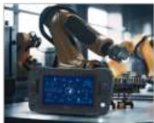
ROBOT CONTROL PANEL

With robust performance, durable construction, and high-precision capabilities, Winmate Robotics Controllers offer reliable and adaptable solutions for the most demanding environments and tasks.